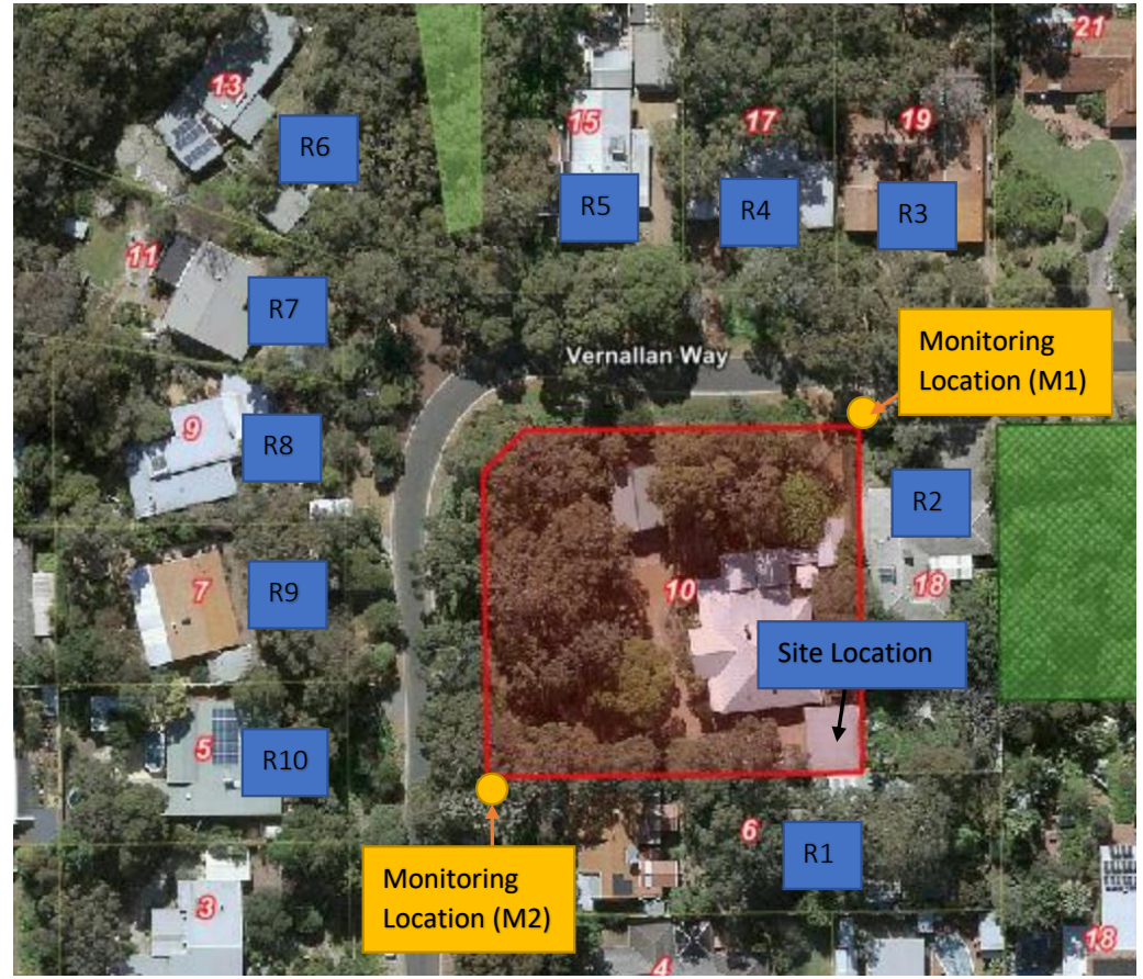
Figure 2: Noise sensitive receiver locations, site location and noise monitoring location.

These locations have been chosen as representative of the nearest noise sensitive receivers. Refer to Figure 2 below for site location(s).