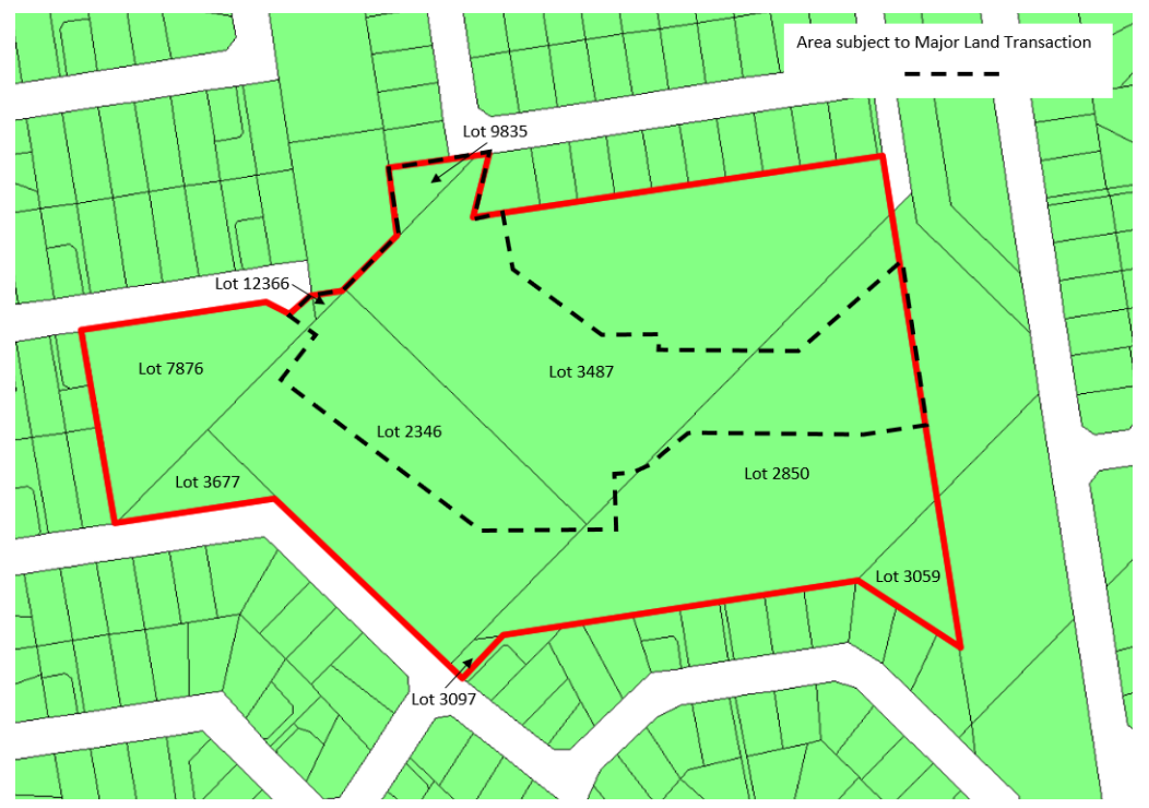
Figure 4: Lot Plan and Major Land Transaction Area