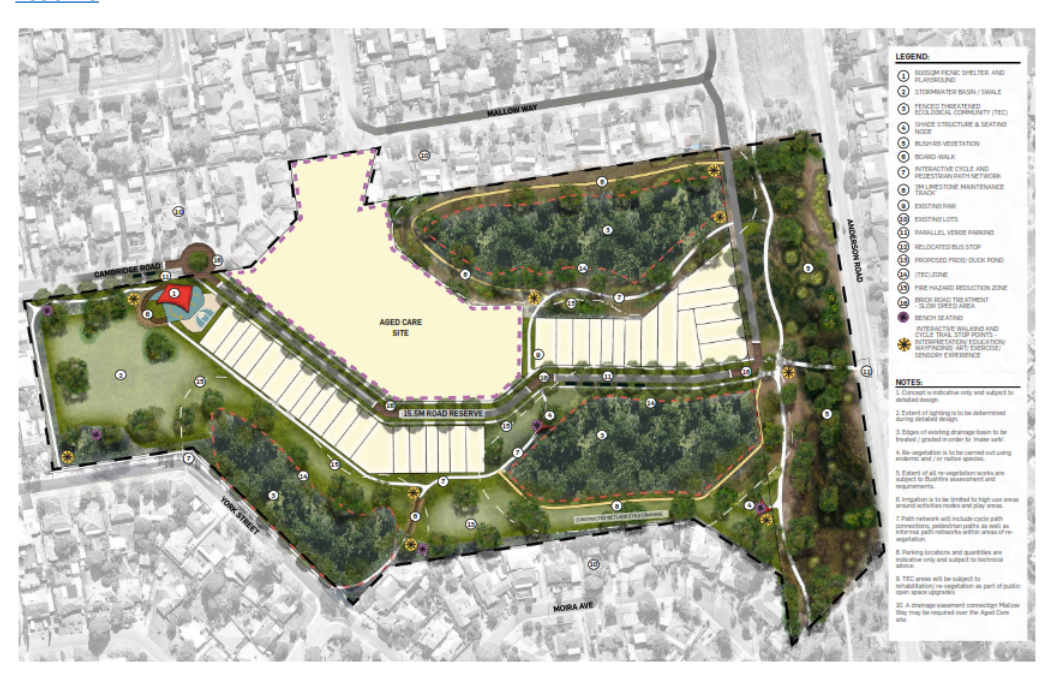
Figure 5: Cambridge Reserve Project Concept Plan

https://www.kalamunda.wa.gov.au/building-development/planning/projects/cambridge-reserve