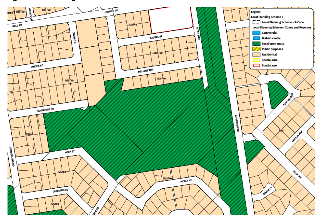
Figure 3: Local Planning Scheme No. 3 Zoning