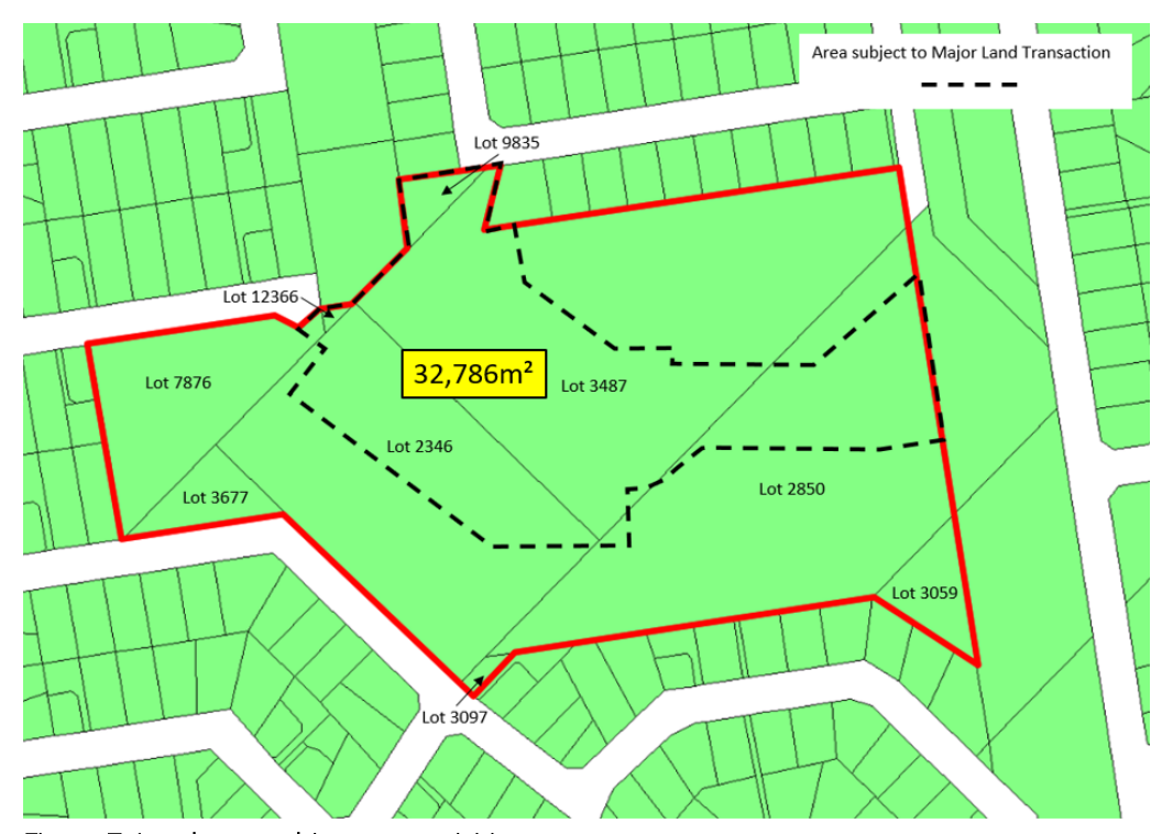
Figure 7: Land area subject to acquisition

Valuations at full commercial land value have been prepared for this acquisition in consultation with Landgate on behalf of DPLH and the City's independent land valuer and identified a total unimproved land value of $2.9m. Given the broader community benefits associated with the proposed Cambridge Reserve Project, DPLH has offered, subject to Ministerial approval, to sell the 32,786m² (approx. 3.28ha) developable portion of the site for a discounted price of $536,500.