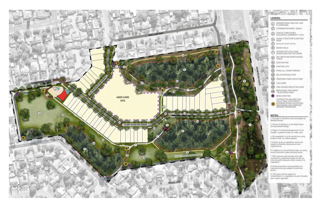
Figure 6: Concept Plan with Option for 1 ha Aged Care site

The City has an extensive history of strategically identifying sites which may be suitable for aged care accommodation. Cambridge Reserve is located close to shops, community services and amenities, and has good access to services including sewer which is preferred for an integrated aged care development.