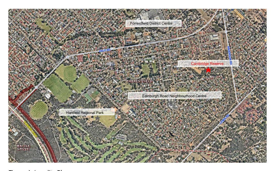
Figure 1: Locality Plan

Cambridge Reserve is currently unimproved containing degraded bushland with portions of uncleared native vegetation. The site has been the subject of anti-social behaviour and degradation over past decades. The housing surrounding Cambridge Reserve provides little surveillance and there are safety concerns stemming from the lack of lighting, formal paths and surveillance. The site contains areas of good quality vegetation but also areas of degraded vegetation, introduced species, and signs of erosion. Despite this, the site is valued by surrounding residents for its informal walking paths, native bushland, and wildlife.