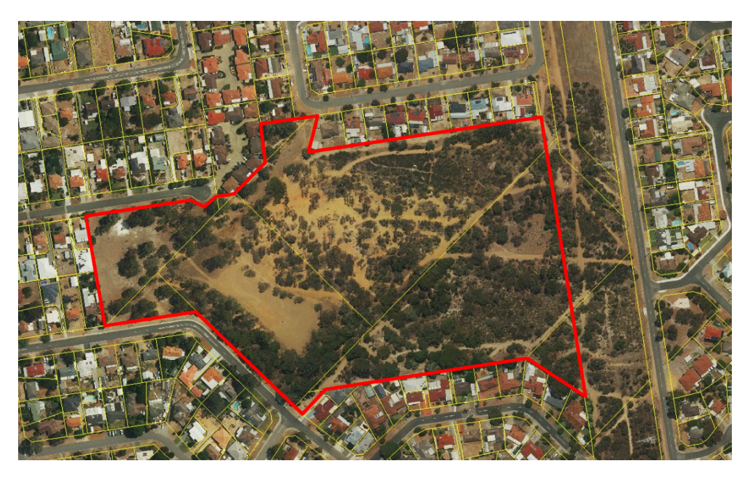
Figure 2: Aerial Image