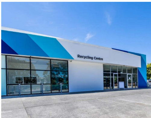
Container Deposit Recycling Centres Example Images