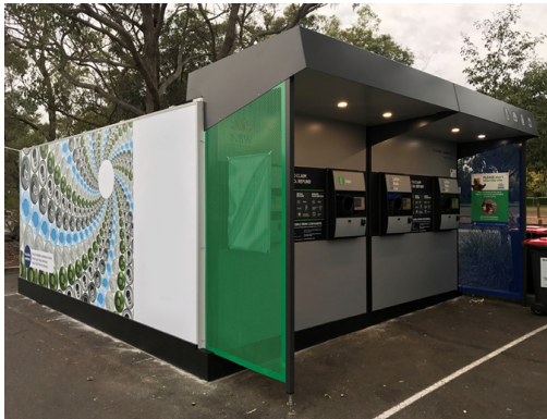
Large Reverse vending Machines Example Images