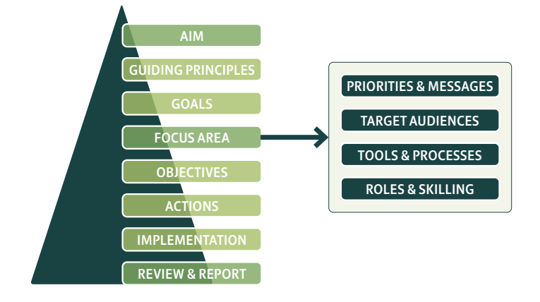
Diagram 1 Conceptual Framework for the Advocacy Strategy