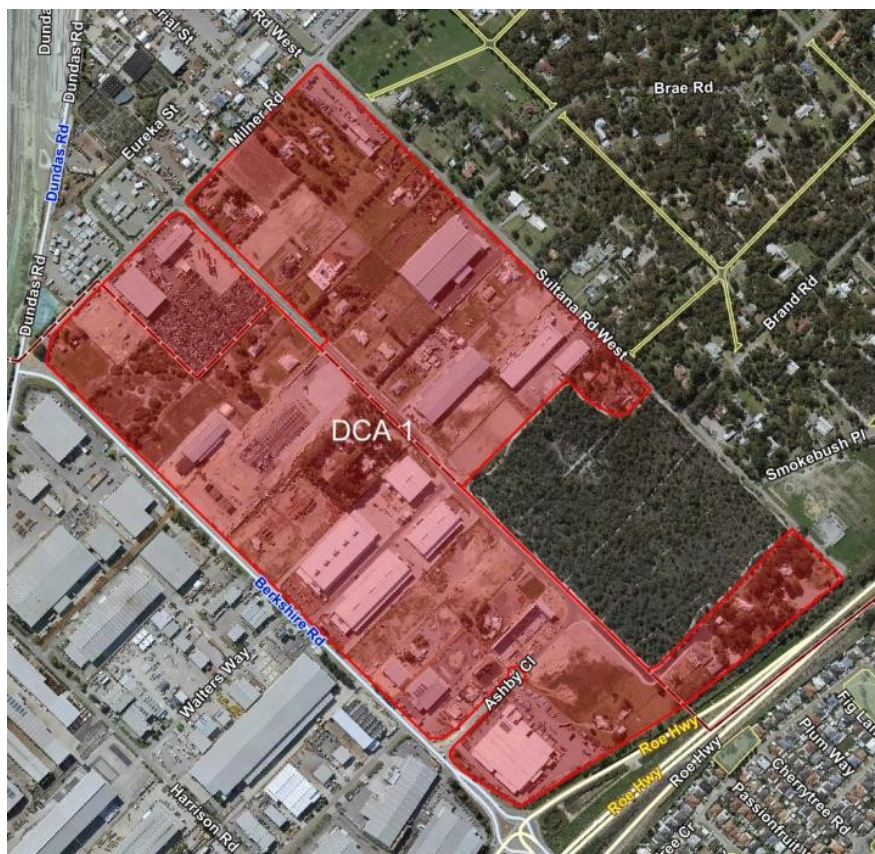
Figure 1 - Development Contribution Area 1 – Forrestfield Light Industrial Area – Stage 1

The location and boundaries of DCA1 are illustrated in Figure 1.