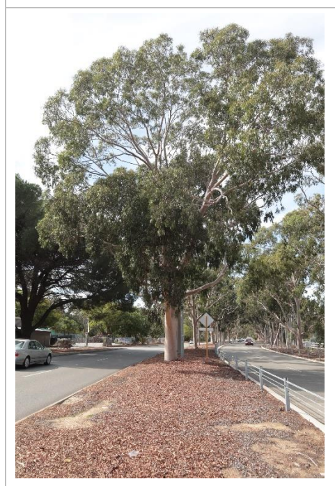
Trees on the median strip, 2018