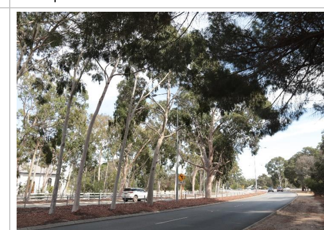
Trees on the median strip looking west, 2018