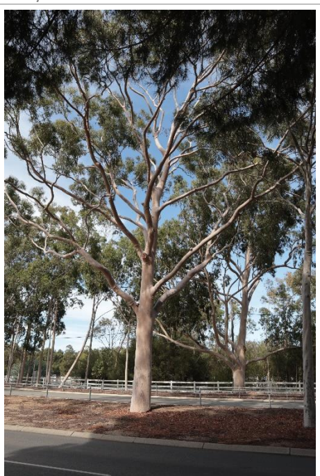
Median strip tree, 2018