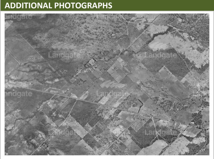
1953, courtesy Landgate, showing original alignment of Welshpool Road

Any alterations or extensions should reinforce the significance of the place, and original fabric should be retained wherever feasible