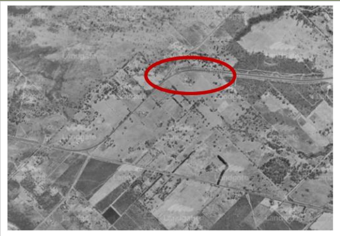
1965, showing alignment of the new Welshpool Road East.