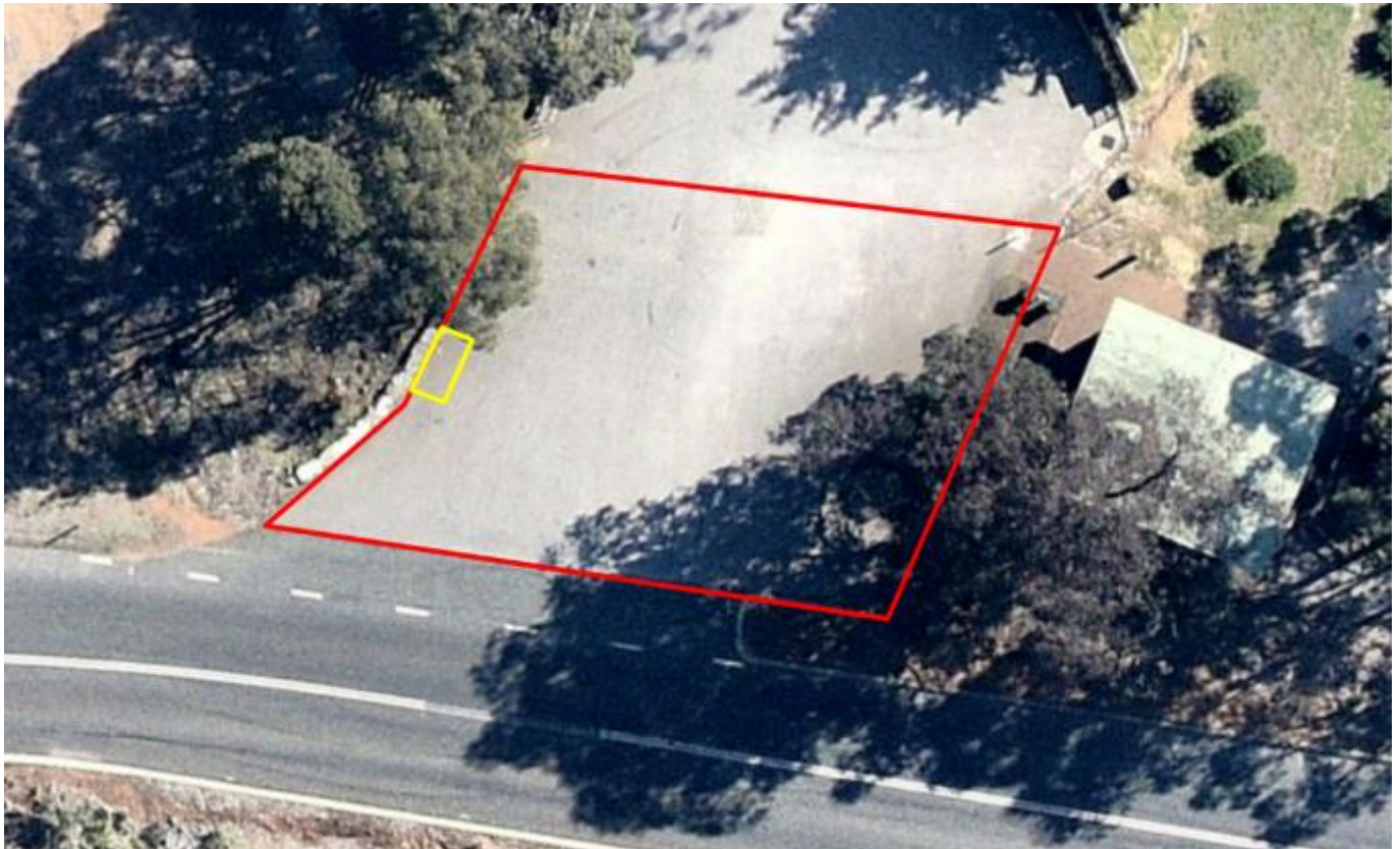
Location 12. Mundaring Weir Carpark, Hacketts Gully