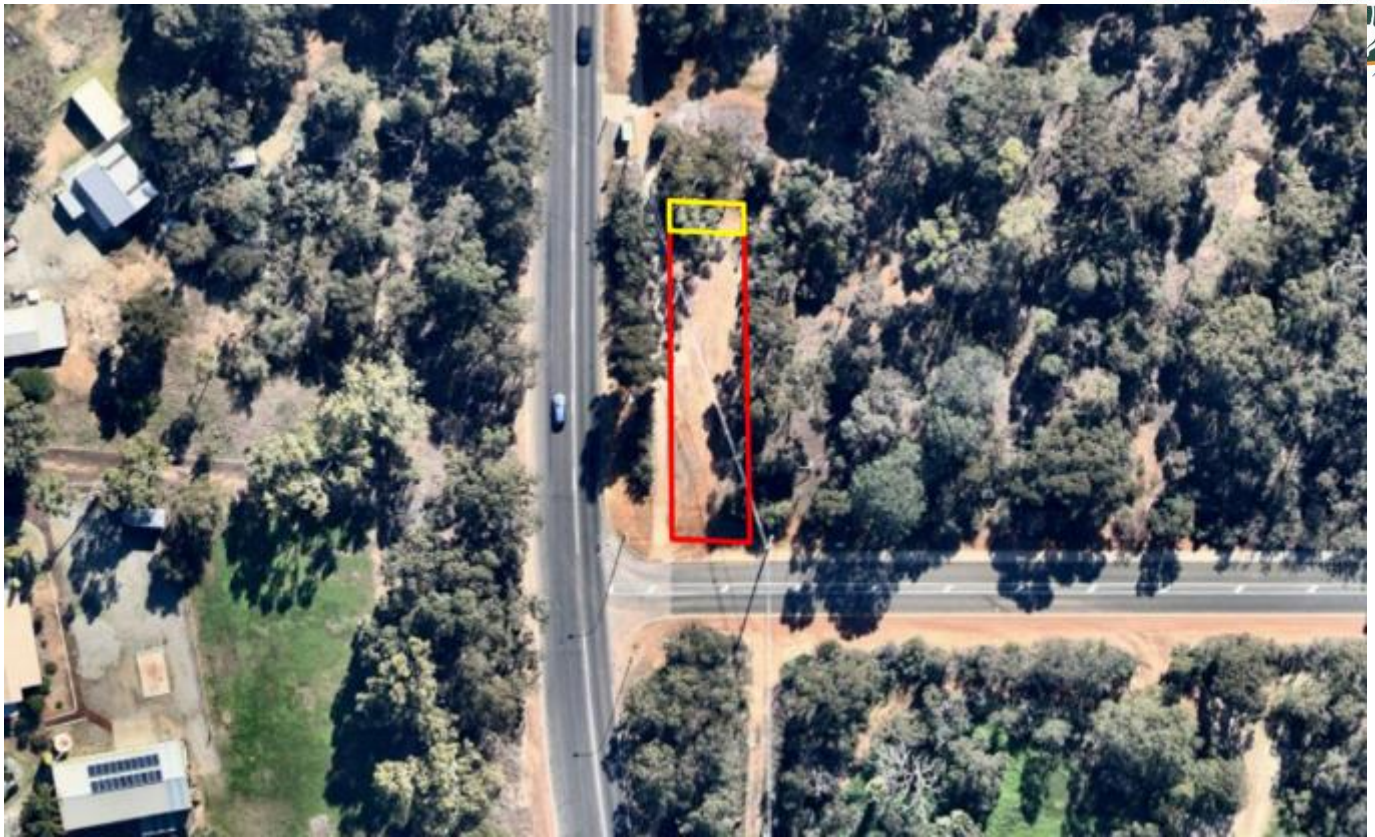
Location 7. Cnr Norwood & Hawtin Rds, Maida Vale