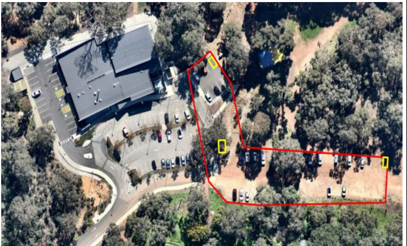
Location 6. Jorgenson Park, Kalamunda