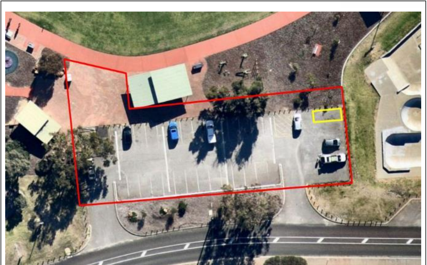
Location 1. Fleming Reserve, High Wycombe