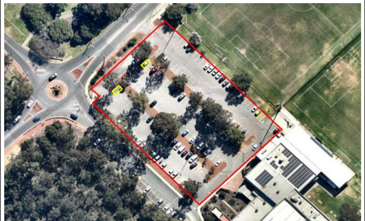
Location 10. Hartfield Park Carpark, Forrestfield