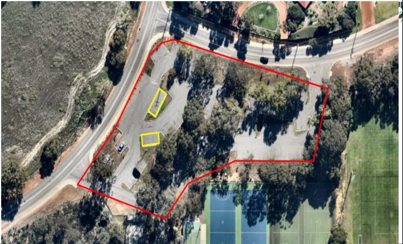
Location 5. Cnr Midland & Kalamunda Rds, Maida Vale