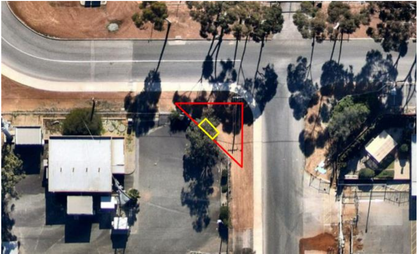
Location 8. Cnr Raymond & Godfrey Rds Walliston