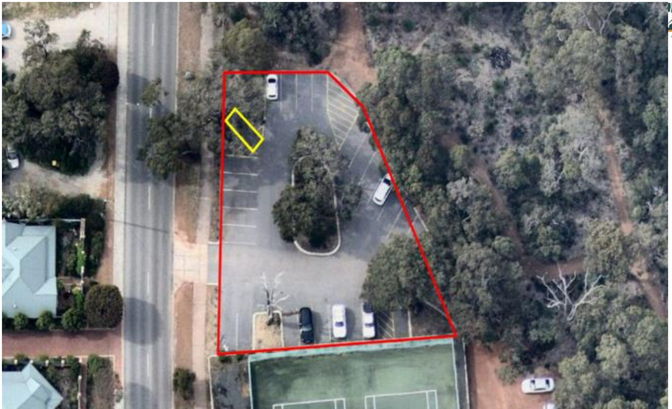
Location 11. Kalamunda Tennis Club Carpark, Kalamunda