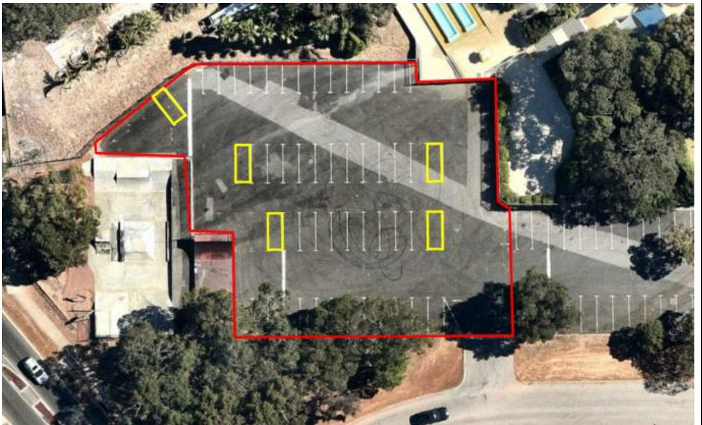
Location 4. Kalamunda Water Par Carpark, Kalamunda (Offseason only)