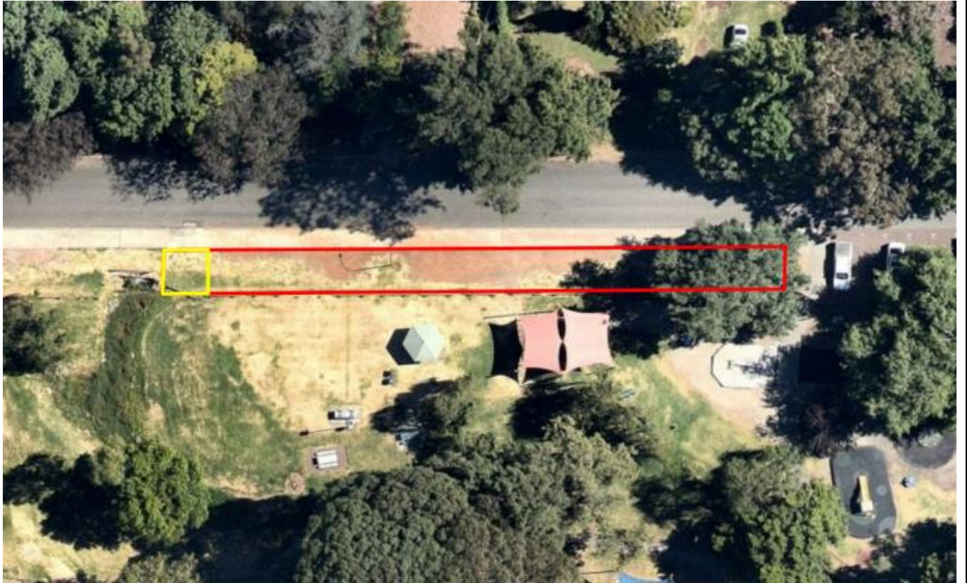
Location 3. Stirk Park, Kalamunda