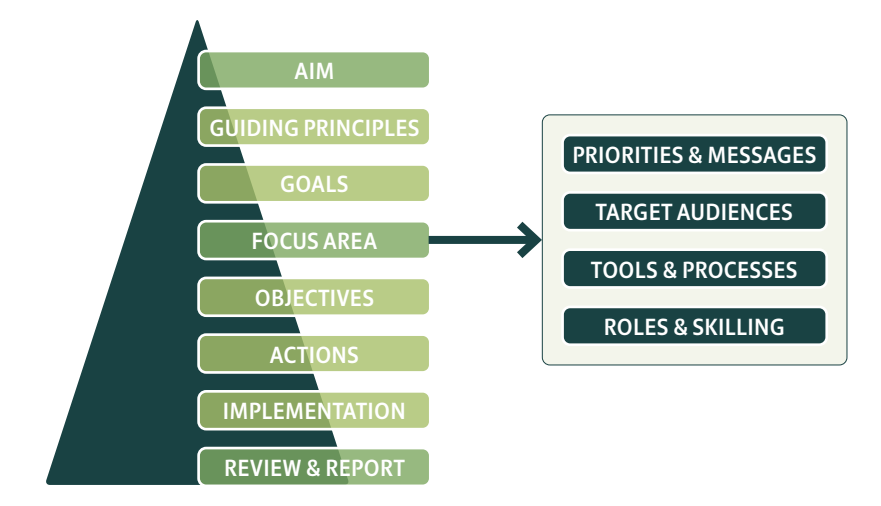
Diagram 1 Conceptual Framework for the Advocacy Strategy