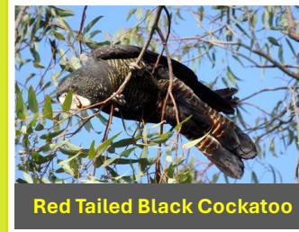
Red Tailed Black Cockatoo