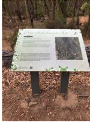
The trailhead sign

The Interpretive Trail was created in 2012 by the Friends of Piesse Brook Inc. It was made possible by a grant from the Department of Environment and Conservation (DEC), now DBCA. DEC also provided valuable assistance with wording, graphic design and structures.