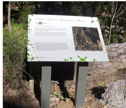
The trailhead sign

This Interpretive Trail was established in 2012 by the Friends on Piesse Brook Inc. It was made possible by a grant from the Department of Parks and Wildlife (DPaW). DPaW also provided valuable assistance with wording, graphic design and structures.