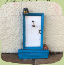
The Clip Joint