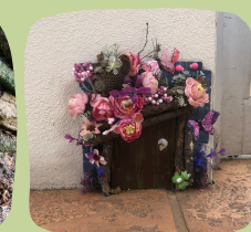
Our Flower Studio