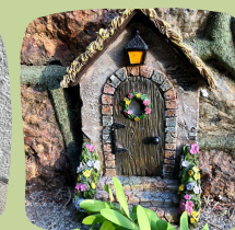
Spring Road Community Garden