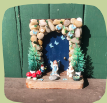
Kalamunda Arts and Crafts