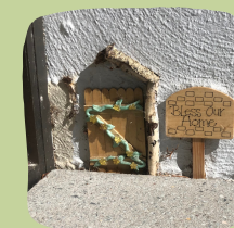
Provincial Real Estate