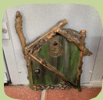
Kalamunda Antiques, Books & Collectables