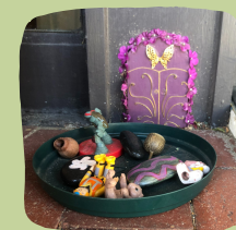
Wild Seasons Flower