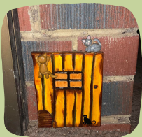
The Cheese Shop